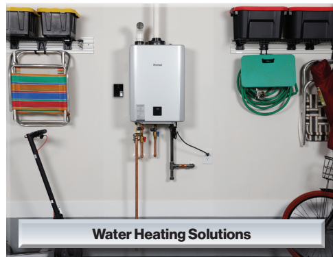
Water Heating Solutions

Dedicated to a smarter kind of comfort, our value-added products continue to stay in step with demands of a changing world.