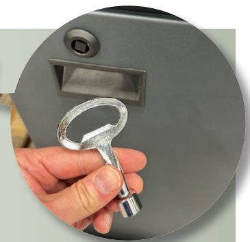
Service Panel Key (only on RCB750AN and RCB1000AN)