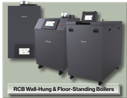
RCB Wall-Hung & Floor-Standing Boilers

In 2018 Rinnai assembled its first tankless water heater in the United States in Griffin, Georgia. Our state-of-the-art facility was completed in 2021 with assembly of the new RE•SERIES™ Non-Condensing Tankless Water Heaters beginning in 2022.