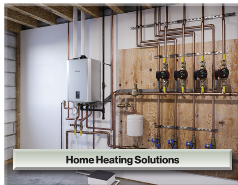
Home Heating Solutions

Rinnai established its US operations in 1974 and introduced Tankless Water Heating to the North American Market in 1999.