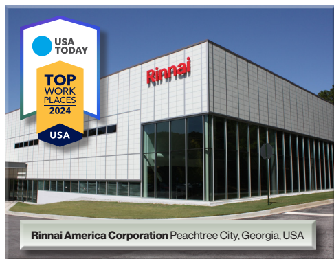
Rinnai America Corporation Peachtree City, Georgia, USA

With headquarters in Japan and a global network of subsidiaries and sales offices, Rinnai has enhanced the way businesses and residences heat their water.