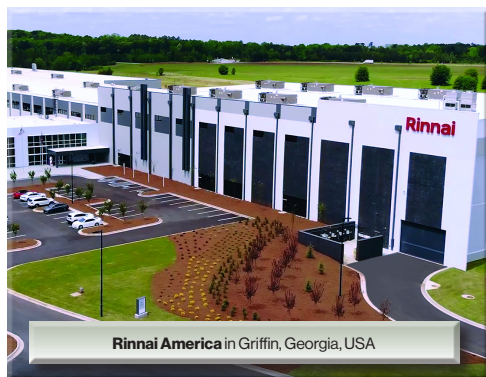
Rinnai America in Griffin, Georgia, USA