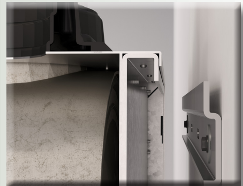
Easy-Hang Wall Mount Bracket