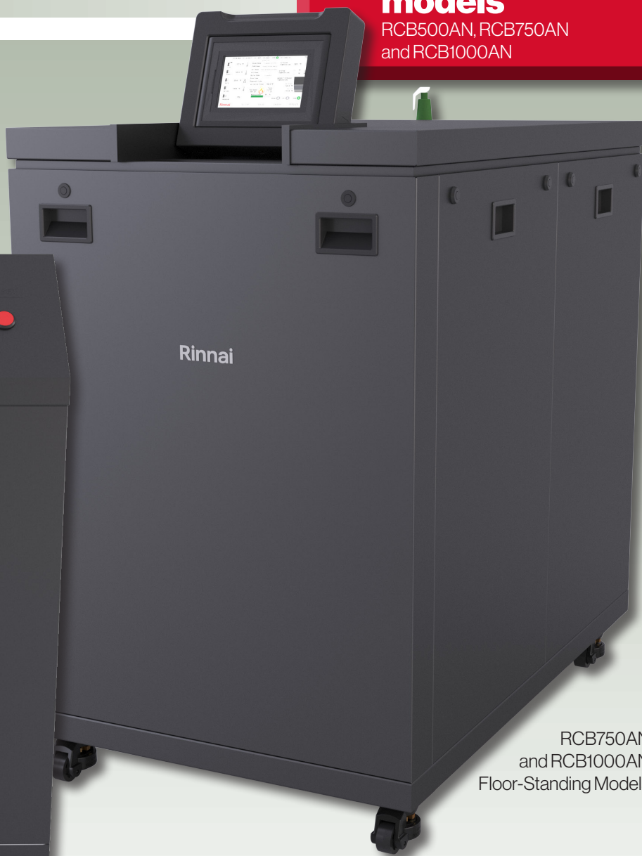
RCB750AN and RCB1000AN Floor-Standing Models