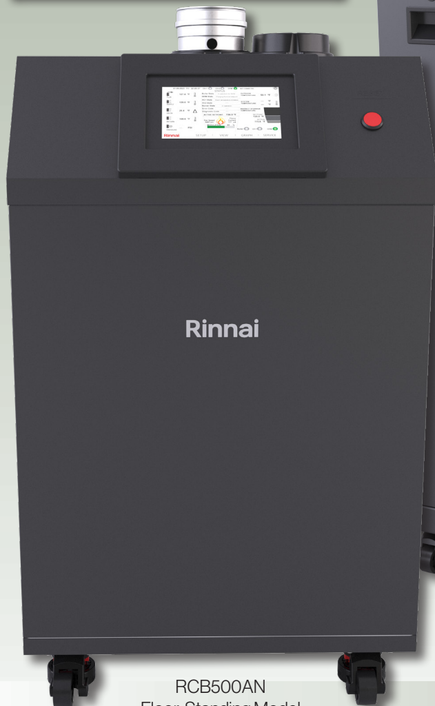
RCB500AN Floor-Standing Model