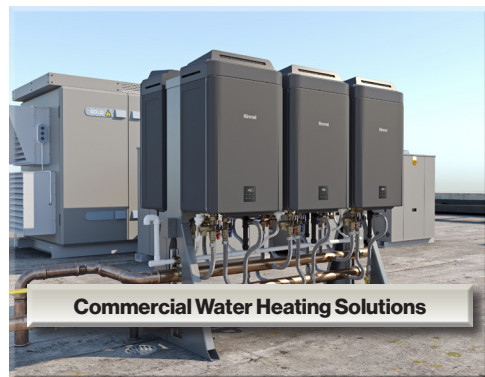
Commercial Water Heating Solutions

Rinnai continues to make significant investments in expanding its operations and product portfolio.