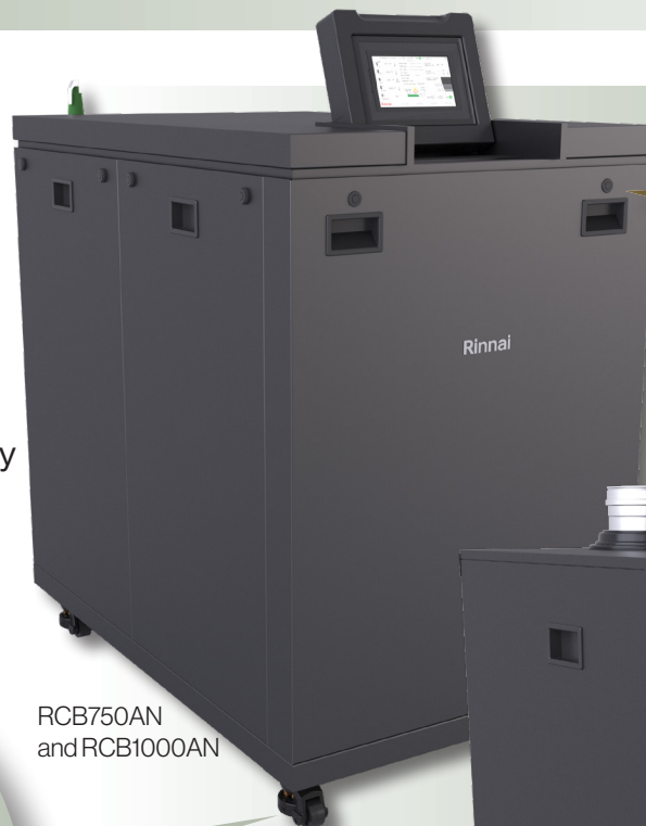
RCB750AN and RCB1000AN