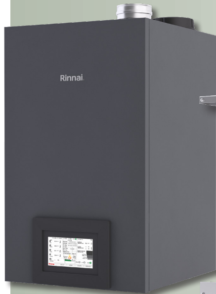
RCB301AN and RCB399AN